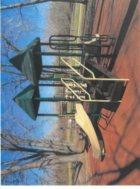
Natural: Green, brown, tan