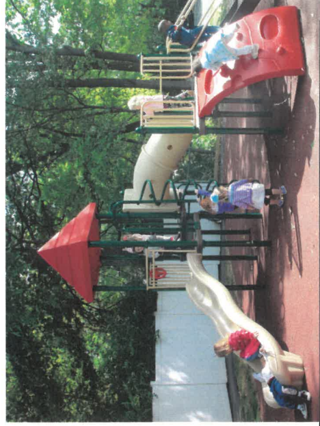
Red, green, tan