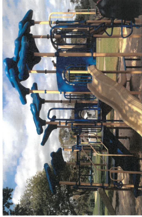
Blue and tan with green accents