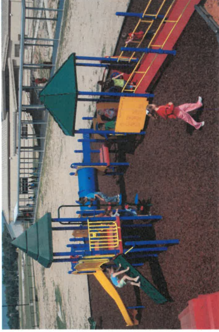
Basic 4: Red, yellow, blue, green