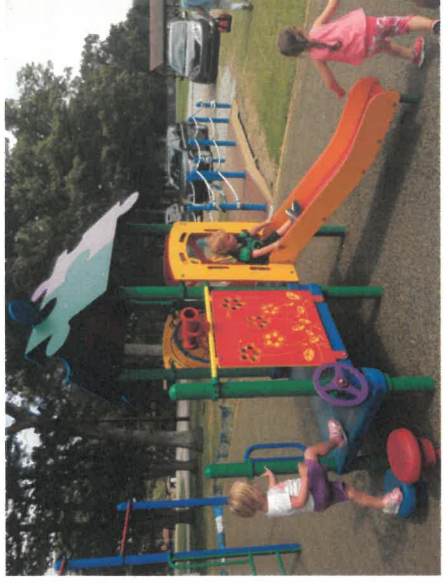
Cheerful Mix: Red, blue, green, yellow, purple